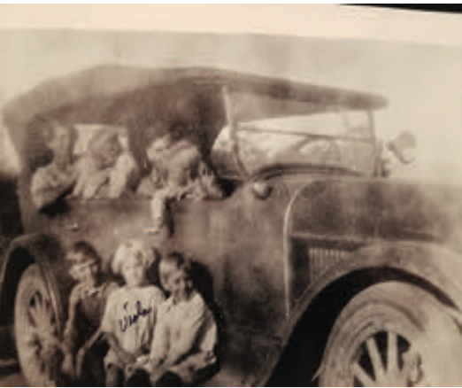
Vi and Friends-1928 Buick

Growing up during the depression in rural Oregon, they never went hungry having a garden, a couple of deer and when they lived near the coast, fish and clams. In fact, nobody ever went hungry in the sharing community where they lived.